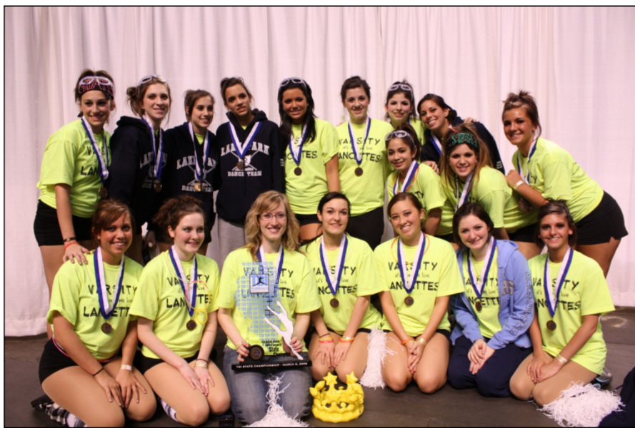
This year is the second time the Lake Park High School Varsity Lancettes won the AAA Open Dance Category at the Team Dance Illinois State Championships. In 2007, they tied for the title with St. Charles North.