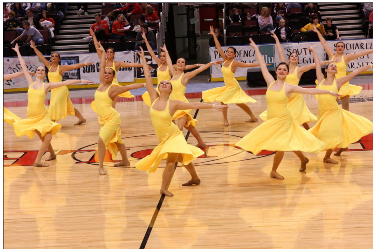
Lake Park High School's varsity Lancettes perform in the AAA Lyrical category at the Team Dance Illinois State Championship in Peoria. The team placed fourth with this routine.